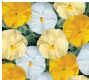
Delta™ Classic Buttered Popcorn Mix