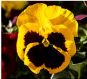
Delta™ Pro Yellow w/Blotch