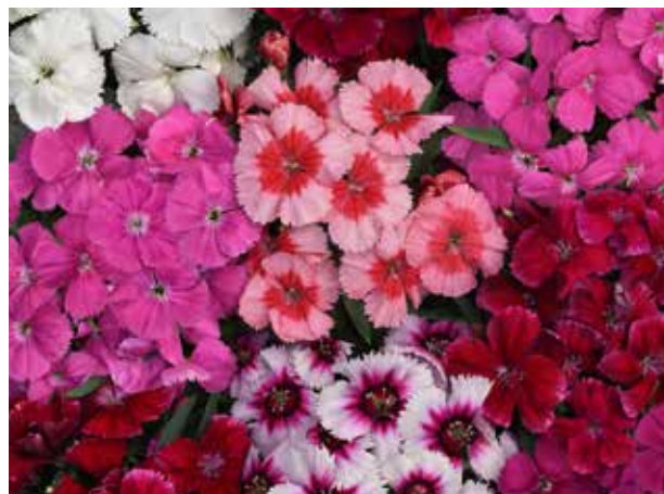
Coronet™ F1 Mix Improved