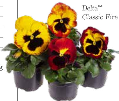
Delta™ Classic Fire