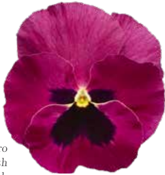
Delta™ Pro Rose with Blotch