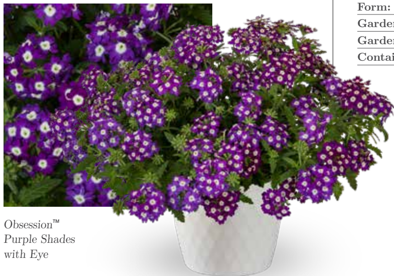
Obsession™ Purple Shades with Eye