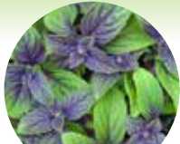
BASIL African Blue Basil

Contact your Griffin Sales Representative to place your order.