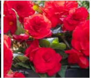
Limitless™ Dark Red