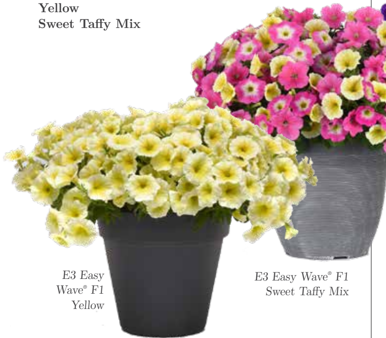
E3 Easy Wave® F1 Yellow