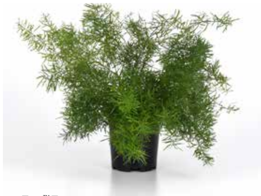
Fuzzy Fern™ Frizz