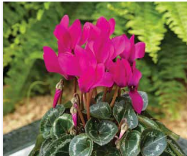
Winfall® F1 Purple Imp