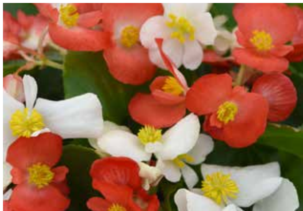
Hula™ Red & White Mix

Containers: 306/1801 Packs, 4-6" Pots, Quarts, Gallons, Baskets