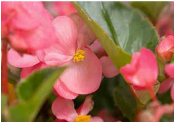
Big Deep Pink GL