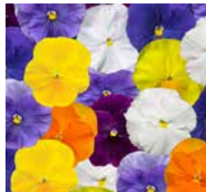
Delta™ Pro Clear Colors Mix