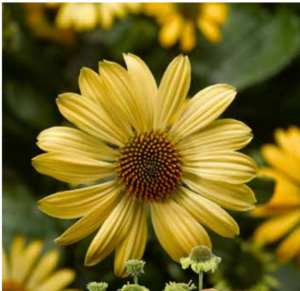
Prairie Blaze™ Golden Yellow