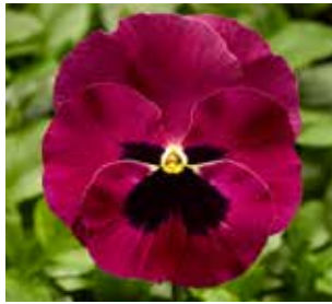
Delta™ Pro Rose w/Blotch