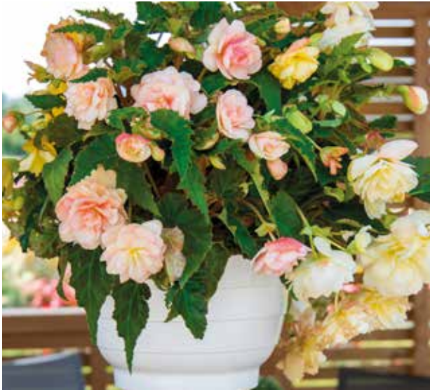
Nonstop Joy Peaches & Dreams