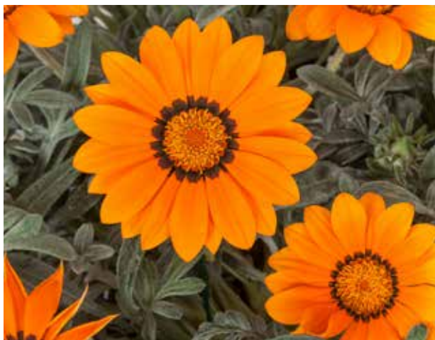
Kiss™ Frosty Orange Improved