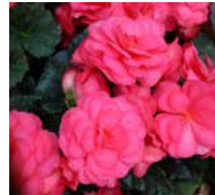
Limitless™ Dark Rose