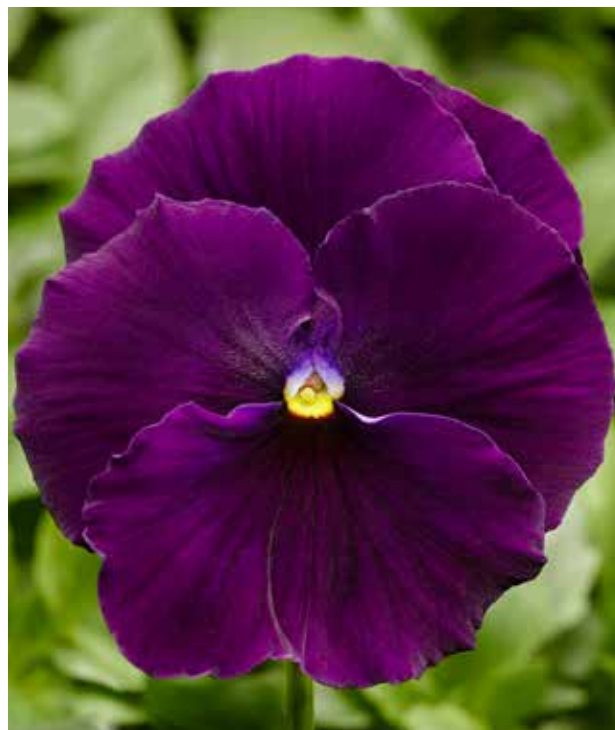
Delta™ Pro Clear Violet