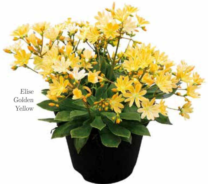
Elise Golden Yellow