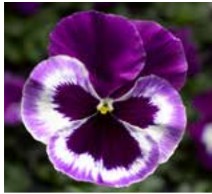
Delta™ Pro Violet & White