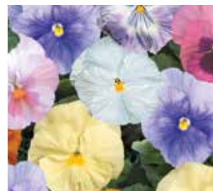
Delta™ Classic Watercolors Mix