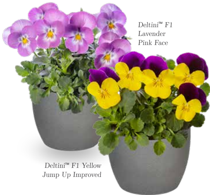
Deltini™ F1 Yellow Jump Up Improved