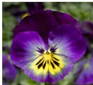
Delta™ Classic Blue Morpho