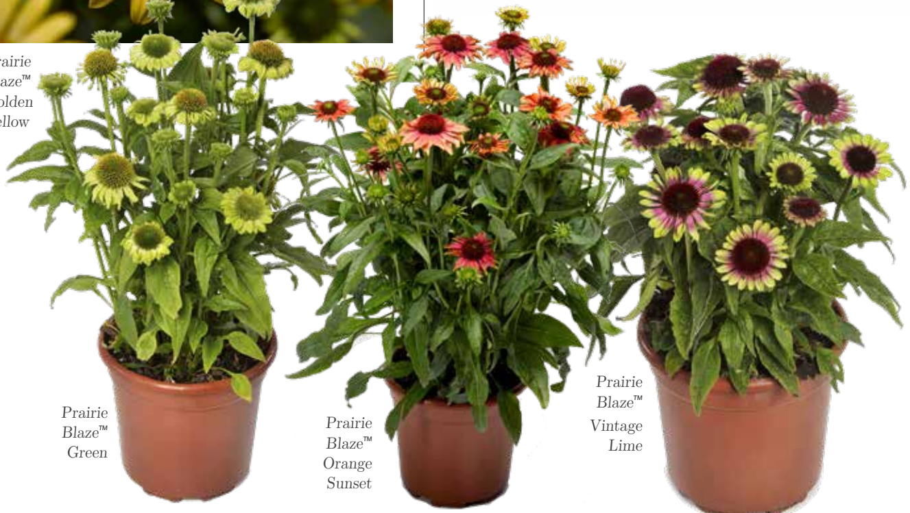
Prairie Blaze™ Green