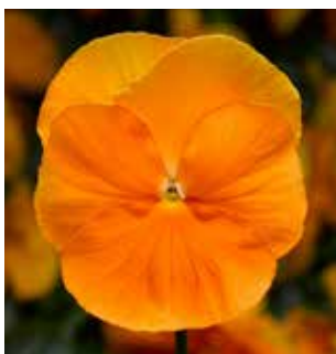
Delta™ Pro Clear Orange