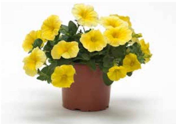
Caliburst™ F1 Yellow