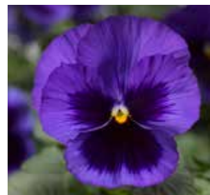
Delta™ Pro Deep Blue w/Blotch