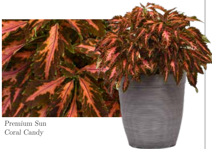
Premium Sun Coral Candy

Containers: 306/1801 Packs, 4-6" Pots, Quarts, Gallons, Combos