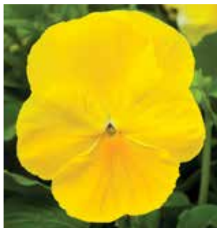
Delta™ Pro Clear Lemon

Rose with Blotch Violet & White White with Blotch Yellow with Blotch Yellow with Red Wing All Colors Mix Blotch Mix Citrus Mix Clear Colors Mix Cool Waters Mix Tricolor Mix