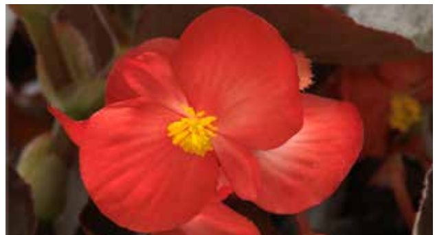
Baby Wing® Red BL