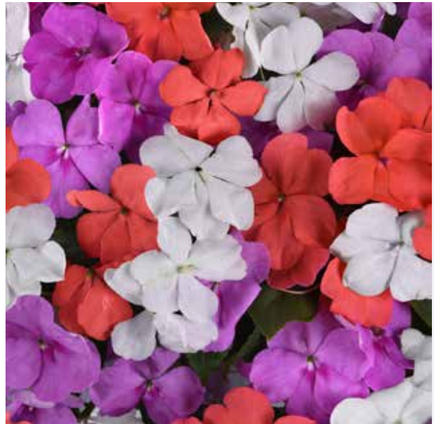
Beacon® F1 Pearl Island Mix