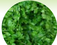
CILANTRO Santo (Cilantro)