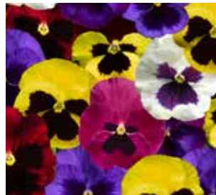
Delta™ Pro Blotch Mix