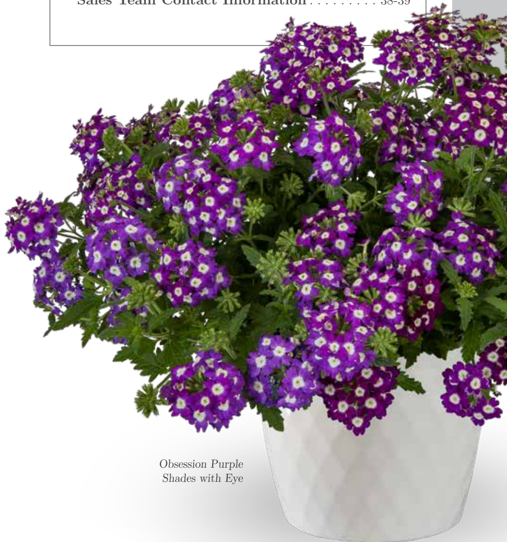
Obsession Purple Shades with Eye