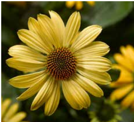
Prairie Blaze Golden Yellow