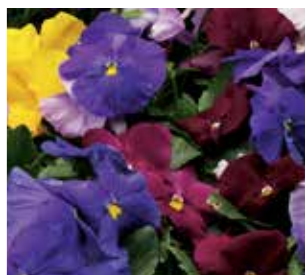
Delta™ Classic Monet Mix