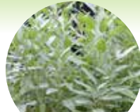
SAGE Garden Sage