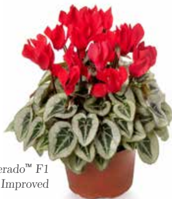
Silverado™ F1 Scarlet Improved