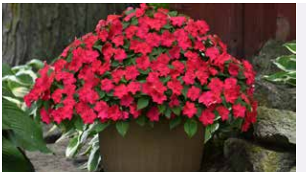
Beacon® F1 Lipstick