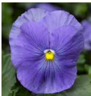
Delta™ Pro Clear True Blue