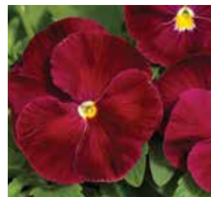
Delta™ Classic Pure Rose