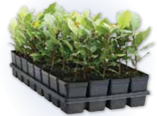
Bay Laurel 32 tray (2.5" pot)