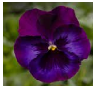
Delta™ Pro Neon Violet