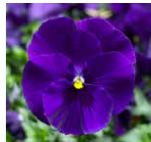
Delta™ Classic Deep Blue