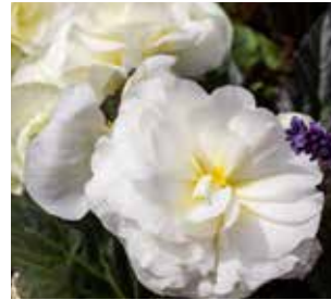
Limitless™ Cream Shades