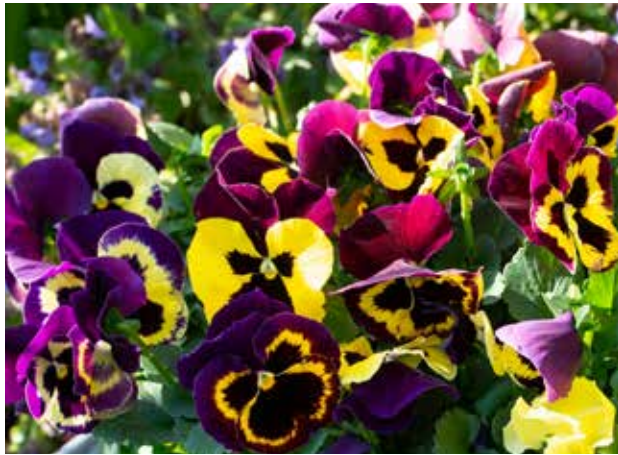
Delta™ Classic Yellow w/Purple Wing