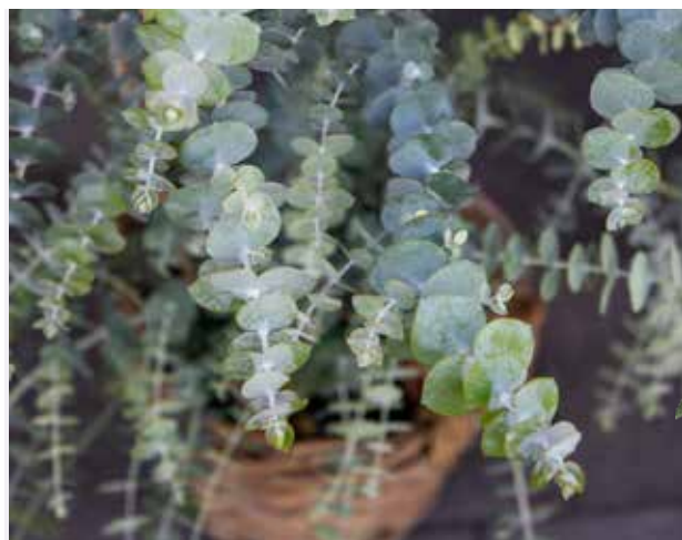
Baby Blue Bouquet