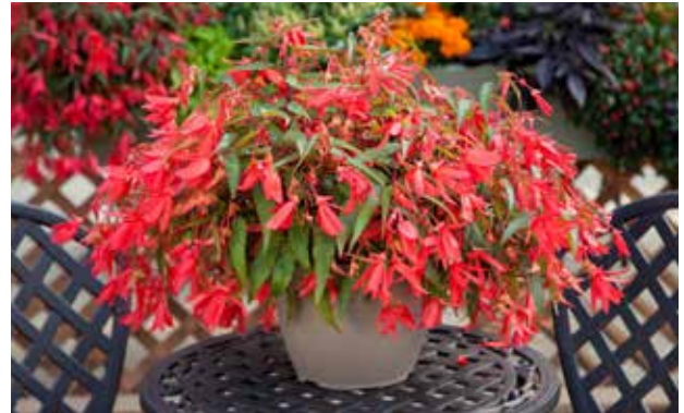
Bossa Nova™ Rose Improved

Containers: 4-6" Pots, 1-3 Gallon Baskets