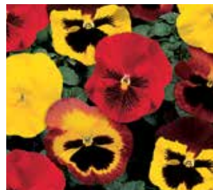
Delta™ Classic Blaze Mix