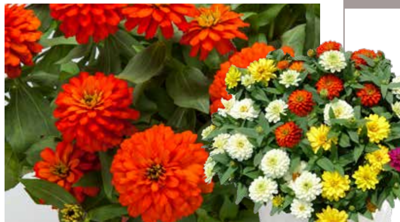
Zydeco™ Fire Improved