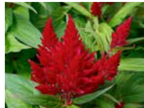
Flamma Bright Red