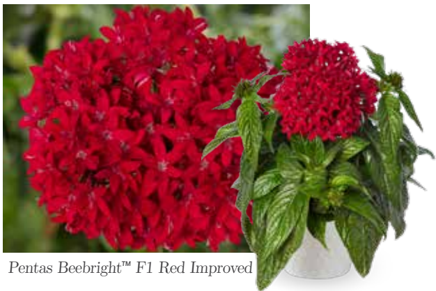
Pentas Beebright™ F1 Red Improved

Containers: Packs, Pints, Quarts - 1 Gallon