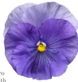
Delta™ Pro Clear Light Blue