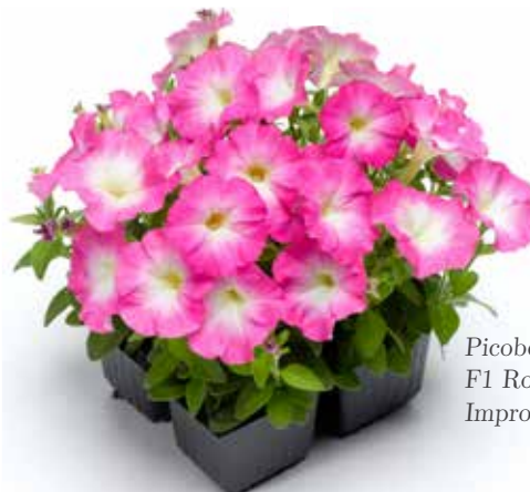
Picobella™ F1 Rose Morn Improved