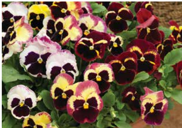
Delta™ Classic Tapestry