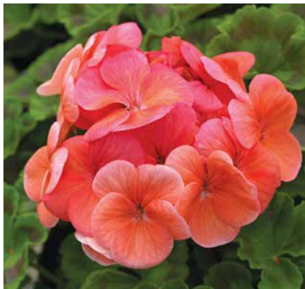
Pinto™ F1 Premium Deep Salmon