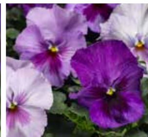
Delta™ Pro Lavender Blue Shades