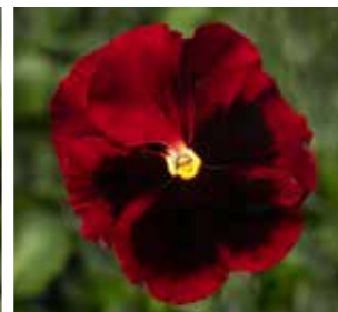
Delta™ Pro Red w/Blotch