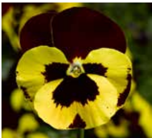
Delta™ Pro Yellow w/Red Wing