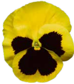
Delta™ Pro Yellow with Blotch