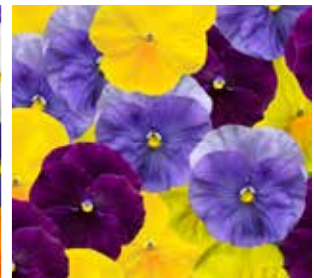
Delta™ Pro Tricolor Mix