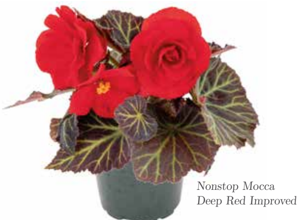
Nonstop Mocca Deep Red Improved