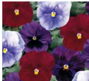
Delta™ Classic Berry Tart Mix