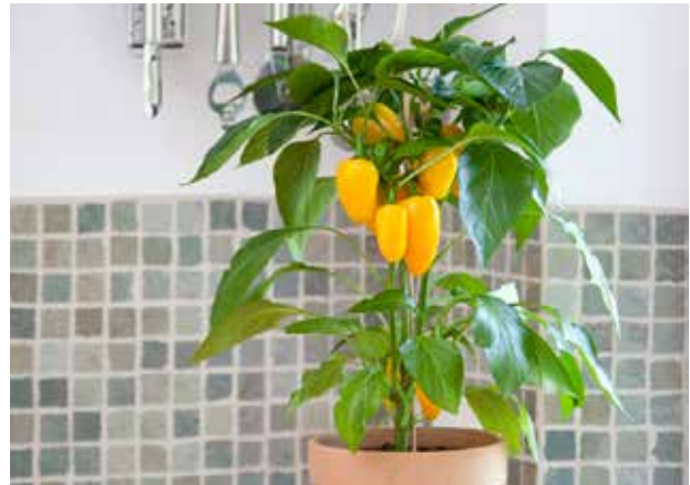
Pepper Fresh Bites Yellow