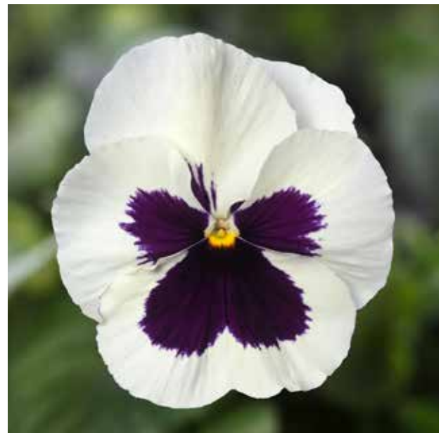
Delta™ Speedy White w/Blotch