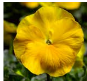
Delta™ Pro Clear Yellow