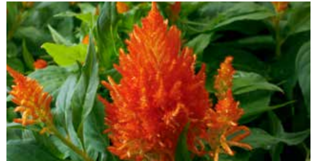
Flamma Orange AAS