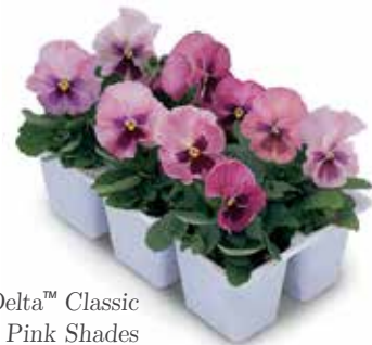
Delta™ Classic Pink Shades