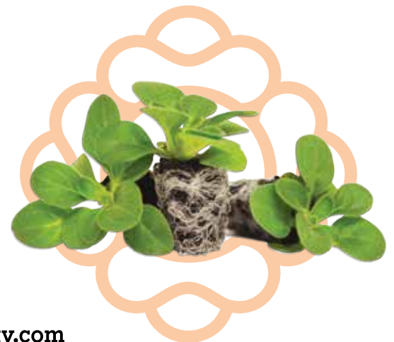
Photo catalog and online availability on our website: www.natbeauty.com email: youngplantcs@natbeauty.com