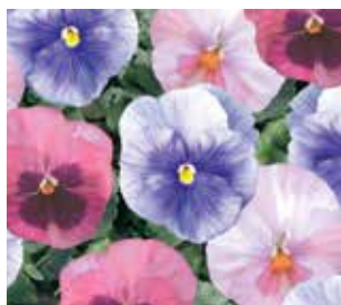
Delta™ Classic Cotton Candy Mix