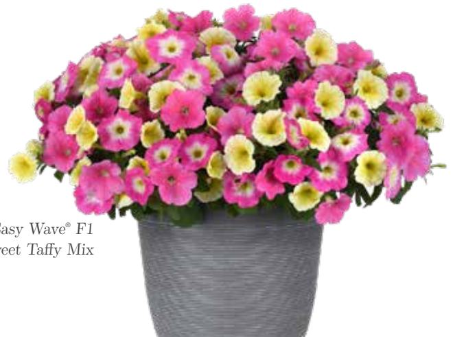
E3 Easy Wave® F1 Sweet Taffy Mix