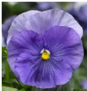
Delta™ Pro Clear Light Blue