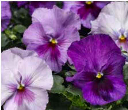
Delta™ Pro Lavender Blue Shades