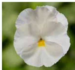
Delta™ Pro Clear White