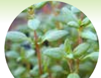
THYME English Thyme

It's 73°F and sunny again in southern California. Plug Connection and Plug Connection Bonsall are located in North county San Diego.