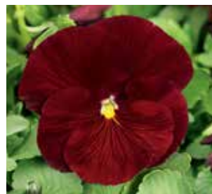
Delta™ Classic Pure Red