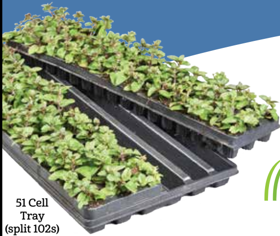
51 Cell Tray (split 102s)