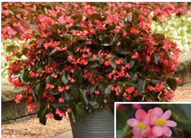
Dragon Wing® F1 Red BL