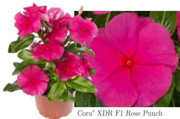
Cora® XDR F1 Rose Punch

Containers: Premium Packs, 1 - 2 1/2 Quarts, 1 Gallon