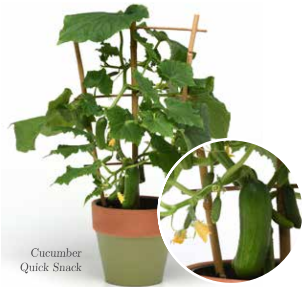
Cucumber Quick Snack