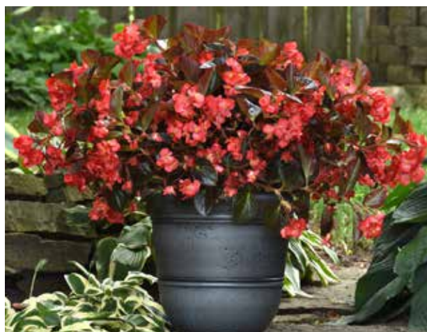
Megawatt™ F1 Red BL