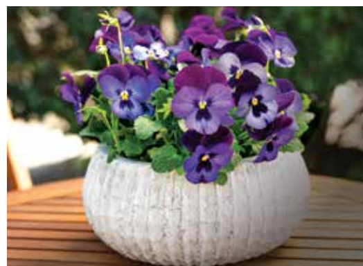
ColorMax F1 Blue Jeans