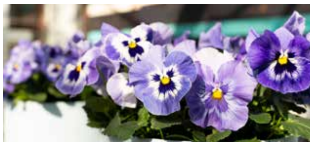
Delta™ Classic Marina