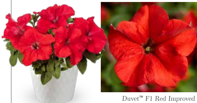
Duvet™ F1 Red Improved

Containers: Packs, Pints, Quarts - 1 Gallon