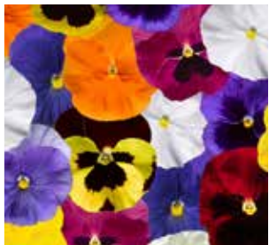
Delta™ Pro All Colors Mix