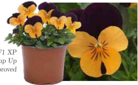
Sorbet® F1 XP Orange Jump Up Improved

Containers: Packs, 4-6" Pots, Quarts-Gallons