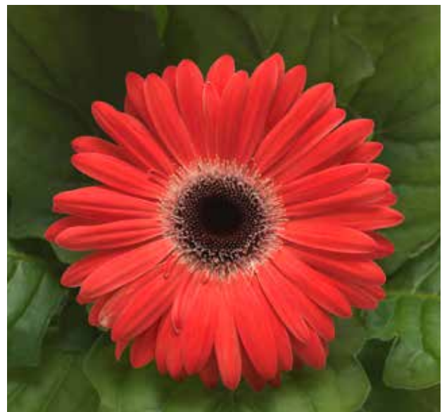
ColorBloom F1 Watermelon with Dark Eye