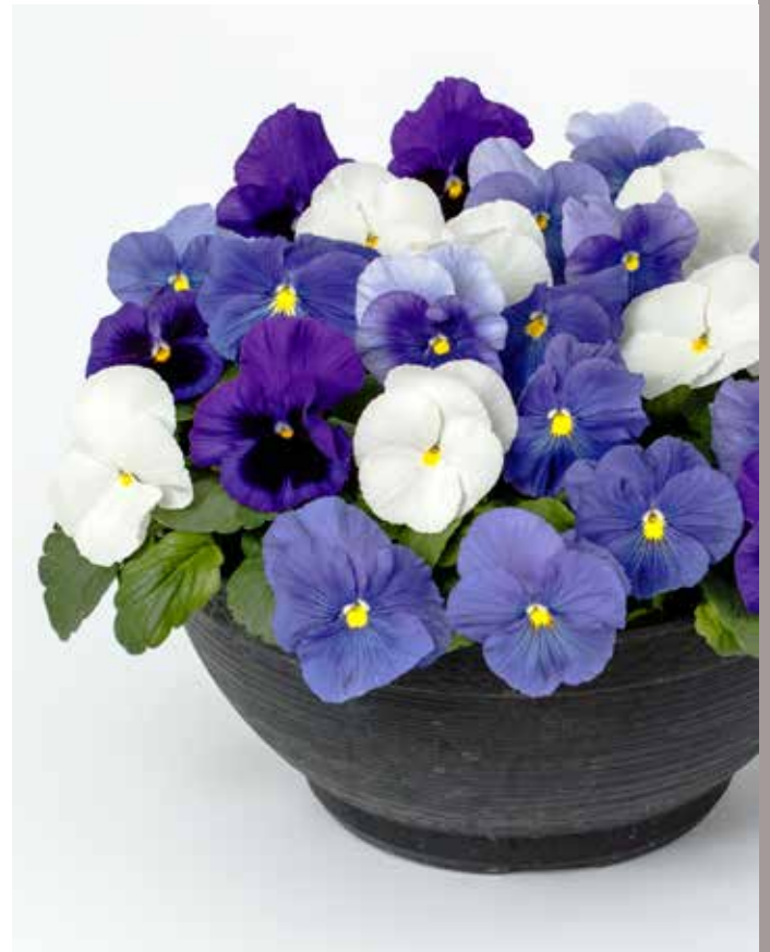
Delta™ Pro Cool Waters Mix