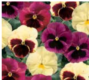
Delta™ Classic Apple Cider Mix