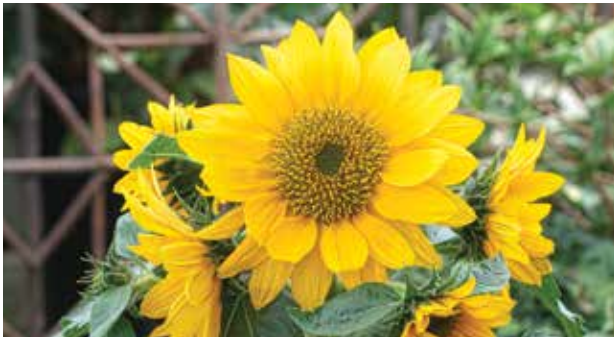
Smiley - F1 Gold