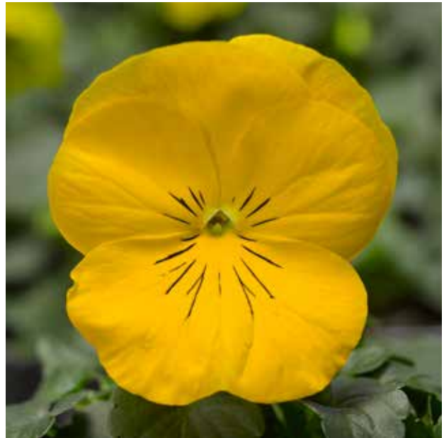
Delta™ Speedy Clear Yellow Improved