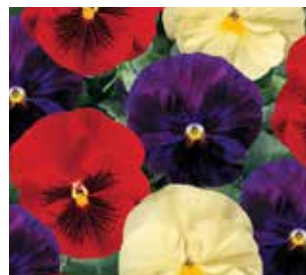
Delta™ Classic Wine & Cheese Mix