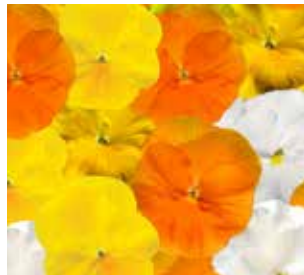
Delta™ Pro Citrus Mix