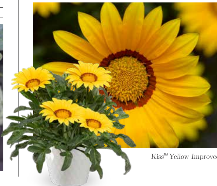
Kiss™ Yellow Improved