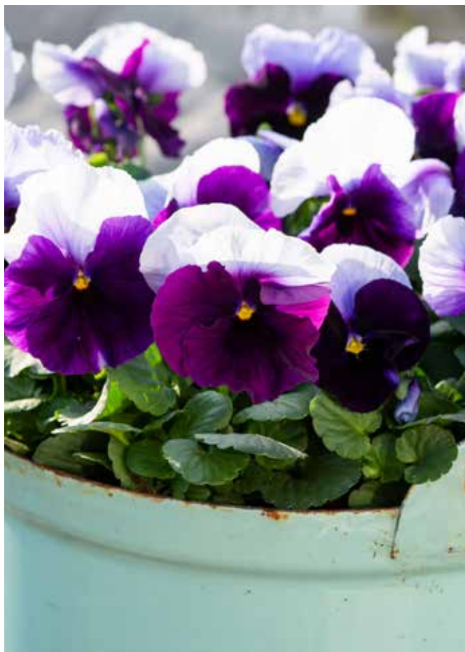
Delta™ Classic Beaconsfield

Yellow with Purple Wing Apple Cider Mix Berry Tart Mix Blaze Mix Buttered Popcorn Mix Cotton Candy Mix Monet Mix Watercolors Mix Wine & Cheese Mix