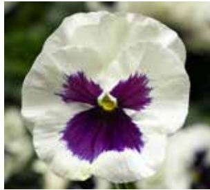
Delta™ Pro White w/Blotch